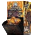
GRAVITY FEED DISPLAY HOLDS 50X 2-PACK 10MG GUMMIES