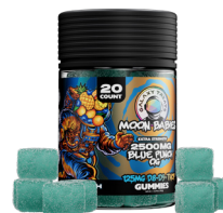
Blue Punch OG