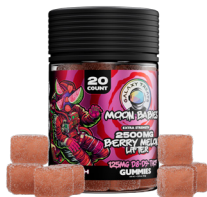
Berry Melon Lifter